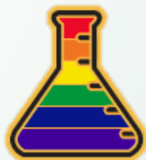
Gay & Transgender Chemists and Allies